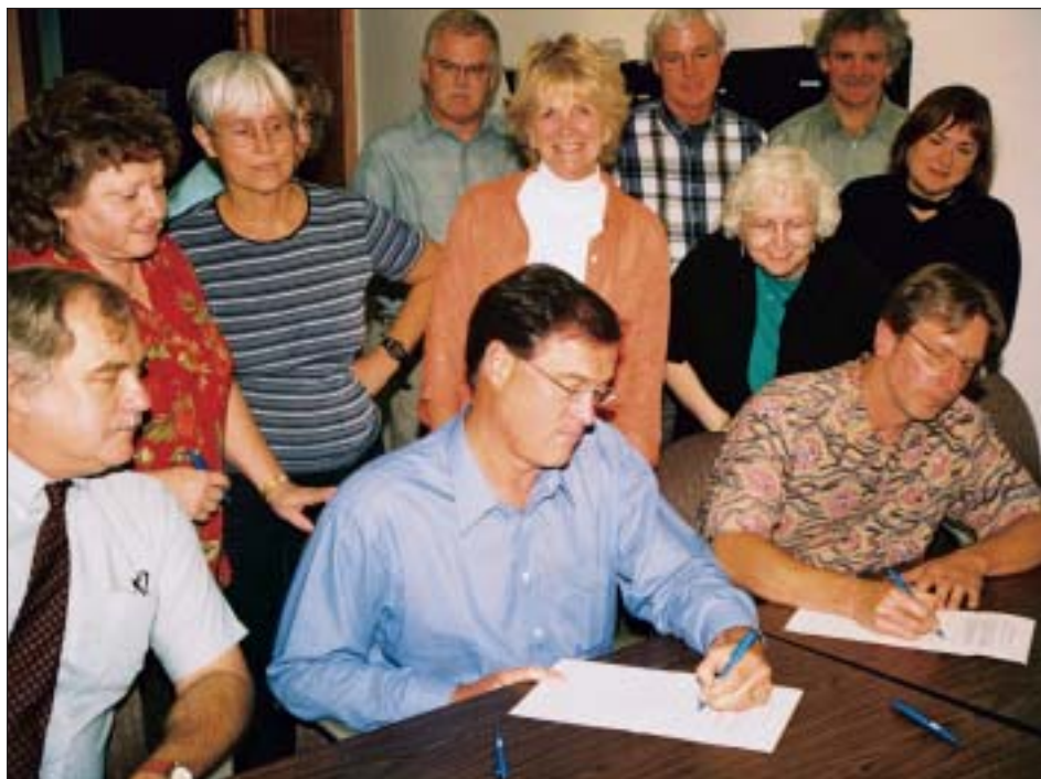
Members of the MCCC Board of Directors sign the HEUU petition

In this world not funding labor contracts is ok because after all the world is run by corporate interests which insist on privatizing every essential service in sight. These corporate interests also insist on "labor flexibility" formerly known as union bust-