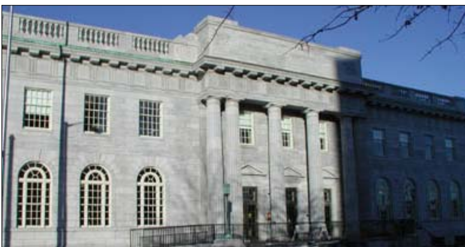
Exterior view of Middlesex CC's Federal Building