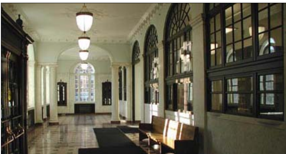
The marble interior of the new Middlesex Federal Building

This semester Middlesex Community College opened a dramatically renovated building at its Lowell Campus. Directly across the street from the main Lowell building, this new building contains classrooms, faculty offices and a spectacular library.