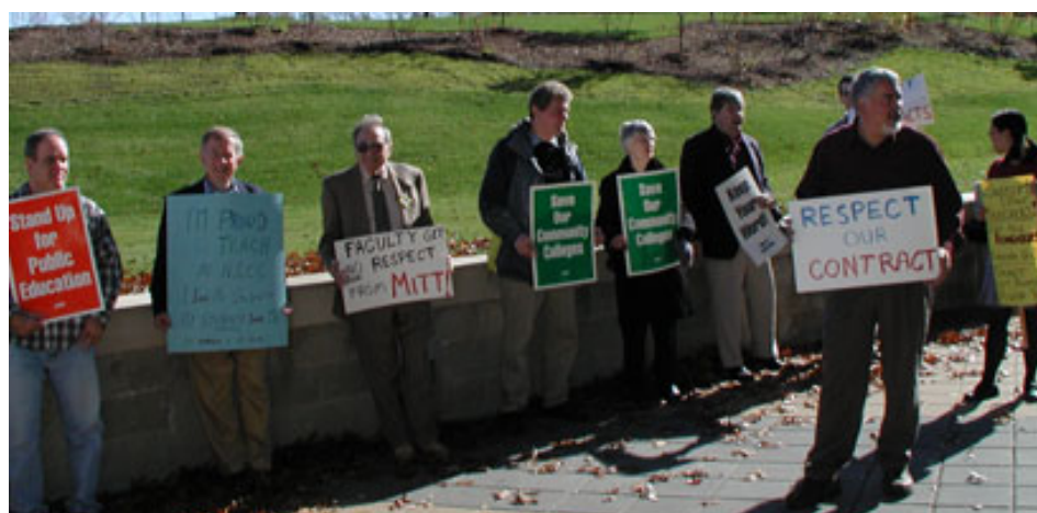
Members of the North Shore chapter, joined by some students, and AFSCME members demonstrate outside of the Danvers Campus to inform students about work-to-rule and the contract situation.

MCCC Newsletter 27 Mechanic Street, Suite 104 Worcester, MA 01608-2402