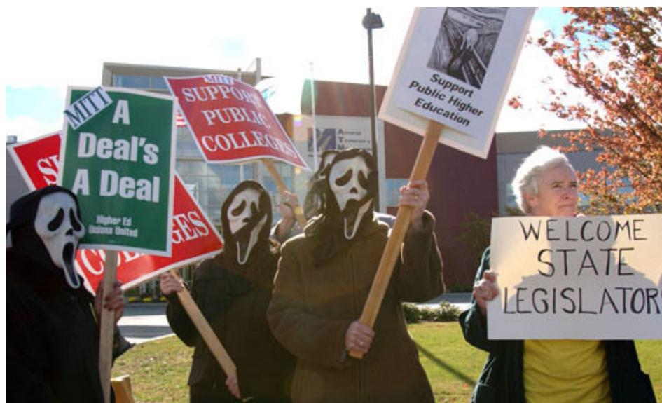
Bristol Community College members scare up some attention by joining UMass Dartmouth in a Romney Watch event.