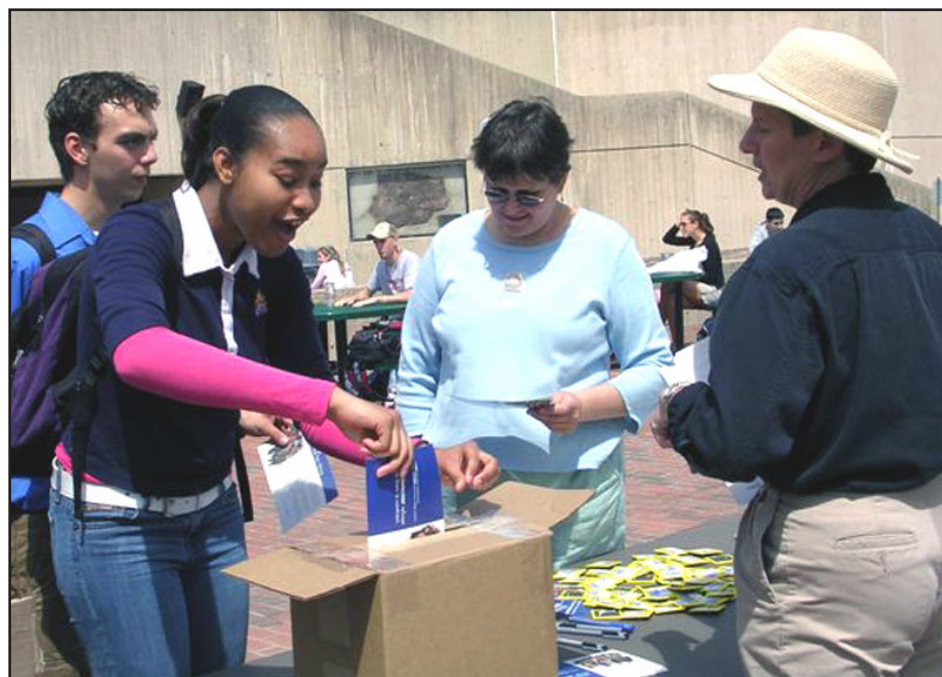
An enthusiastic Holyoke CC student sends her postcard of support.